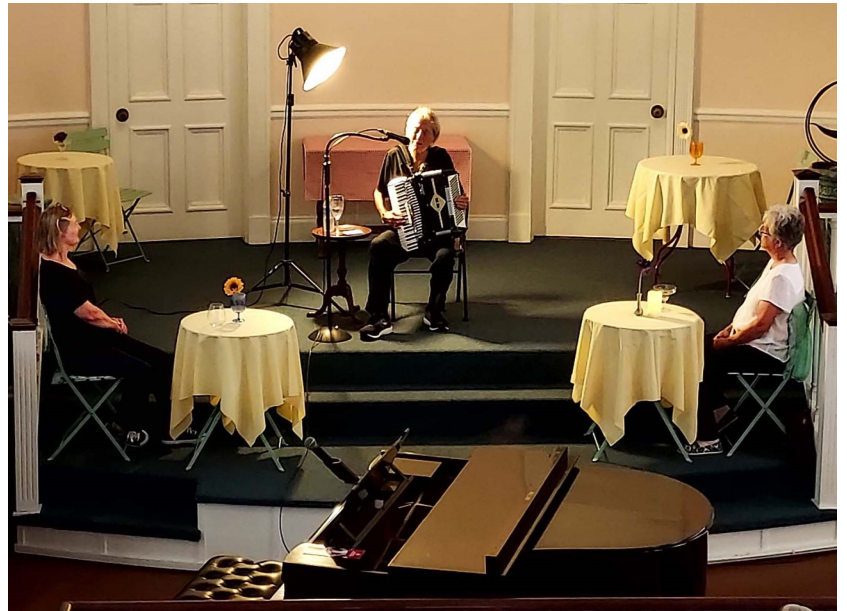
The inestimable Pavia in concert